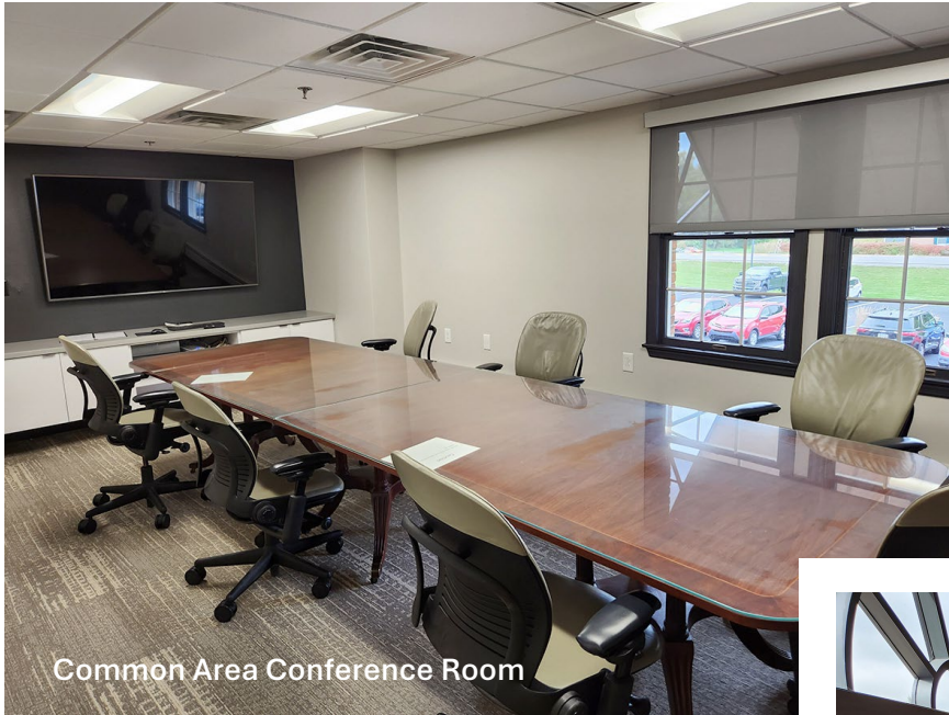
Common Area Conference Room