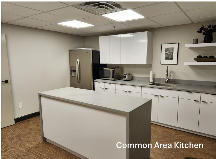
Common Area Kitchen