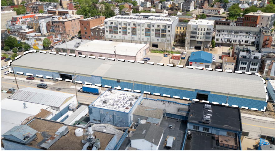
3430 SMALLMAN STREET