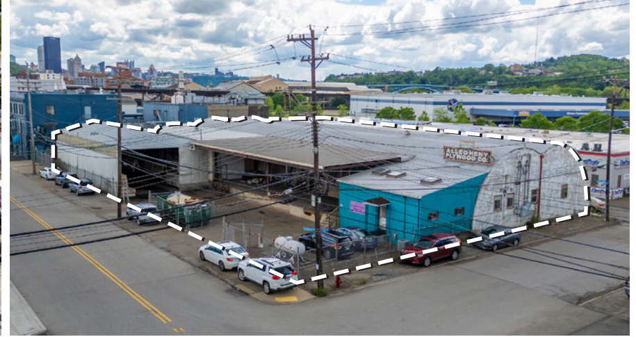
3433 SMALLMAN STREET